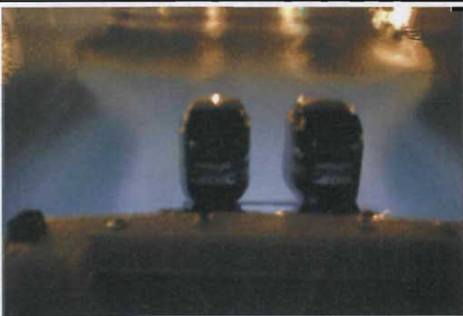
TWIN OUTBOARD INSTALLATION