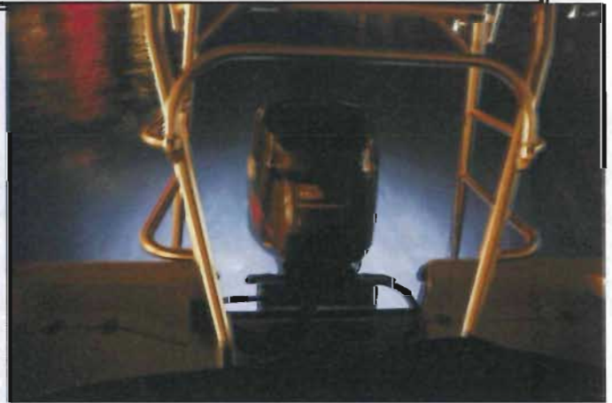
SINGLE OUTBOARD INSTALLATION